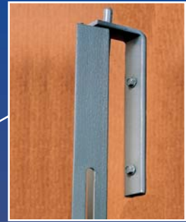
"L" Brackets allow gates to be installed on surface or recess. Extended brackets facilitate installing inside of overhead door tracks.