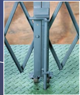
The Drop Pin slips into the same size hole and is secured by a gusset angle on opposite gate rail.

SECURE Receiving Doors • Lift-Up Door • Entranceways • Hallway