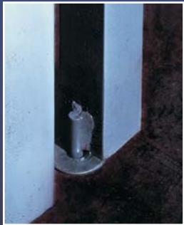
Bottom Mount is the lower pin inserted through a bearing washer into a 1/2" x 2" hole drilled into the floor