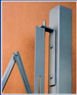
Standard Pin Type Mount with "L" Bracket holds top of gate to wall

Ventilation • Visibility • Access Control